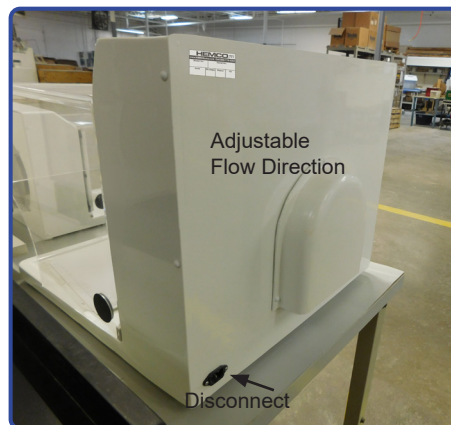
Rear view of MicroFlow III