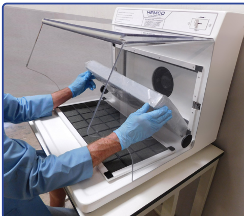
Remove plastic wrap from carbon filter & snap into place using filter clips