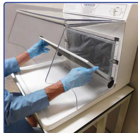
Install particle prefilter and attach using velcro